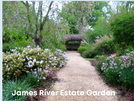
James River Estate Garden

https://www.nps.gov/articles/wilton.html