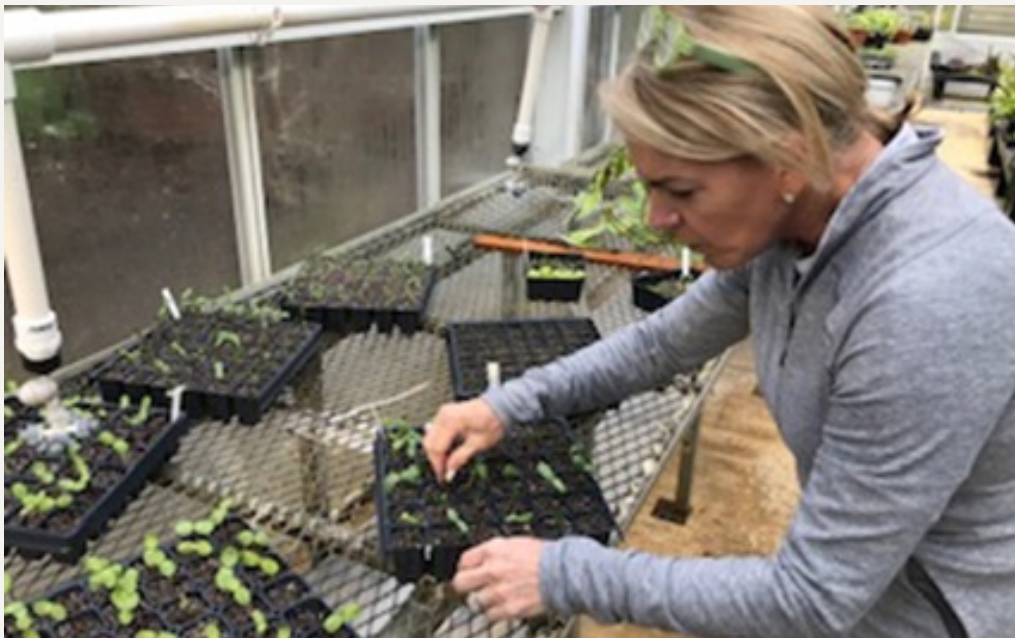
Our sunflower seedlings at the Dixon are looking good.

The Zone IX horticulture chair has recommended a website for those interested in seed starting. It is free to register with Floret, a flower farm in Washington. Find the link to Floret on the MGC website under the Horticulture tab.