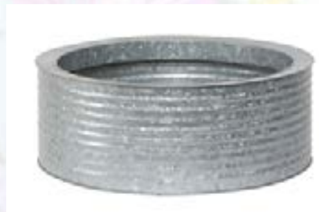
Class 3: Garden Design